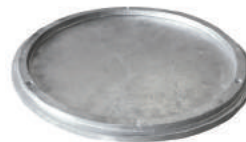
X Bottom Disc