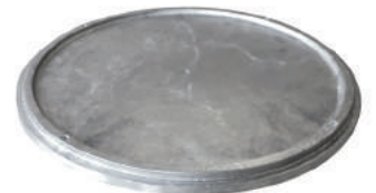
J Bottom Disc