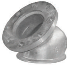
45° Companion Flange