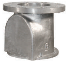
Vertical Companion Flange