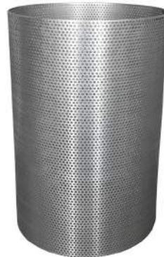
X Screen 1/8"