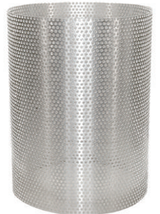
J Screen 1/4"