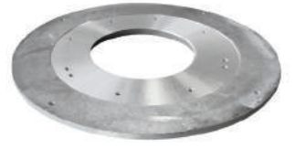
J Series Seat Ring