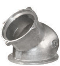
45° OD Tube