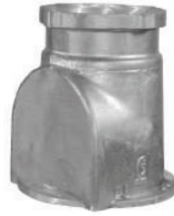
Vertical OD Tube